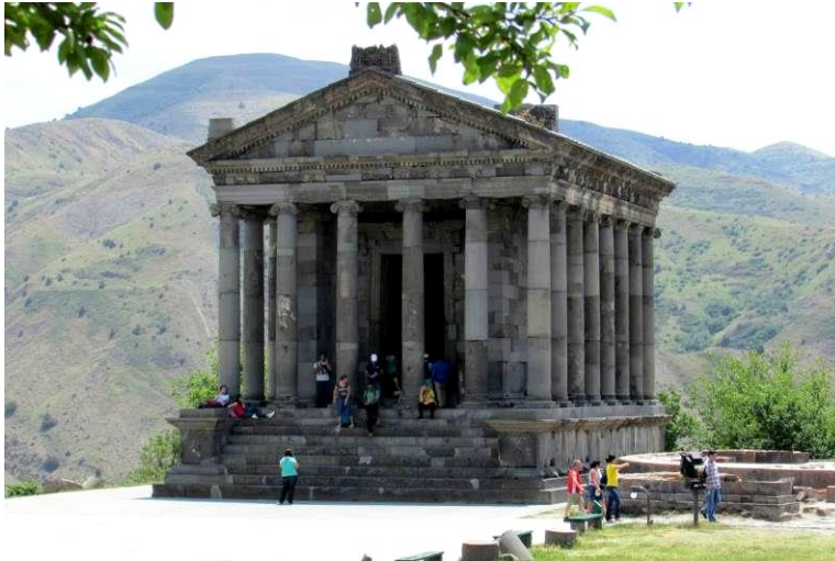
Garni Hellenistic temple