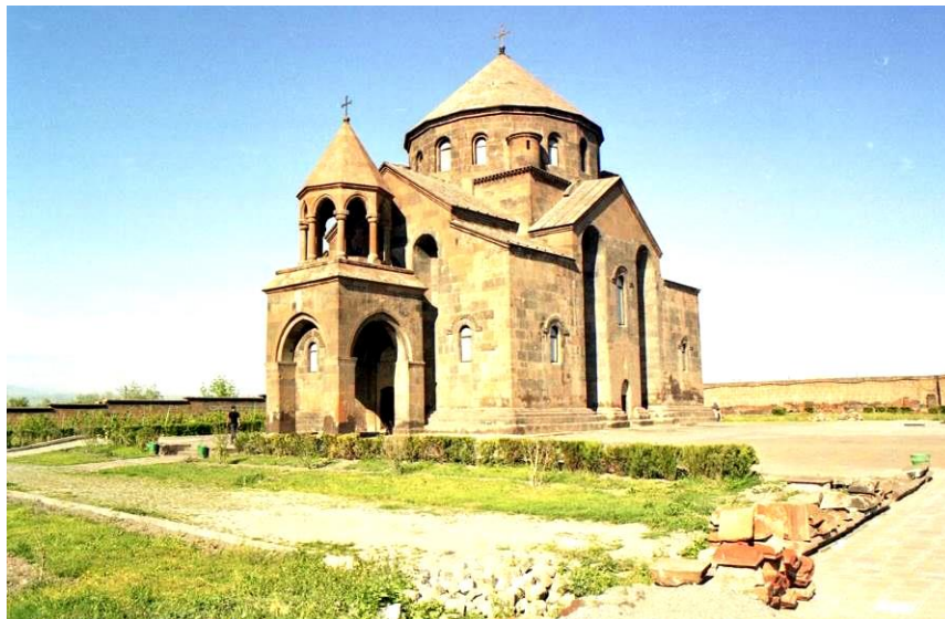
Hripsime church (7 th Century AD)