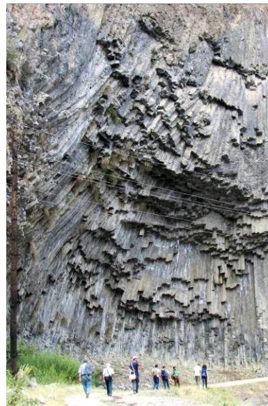
Garni columnar lava flow, 127 Ka,